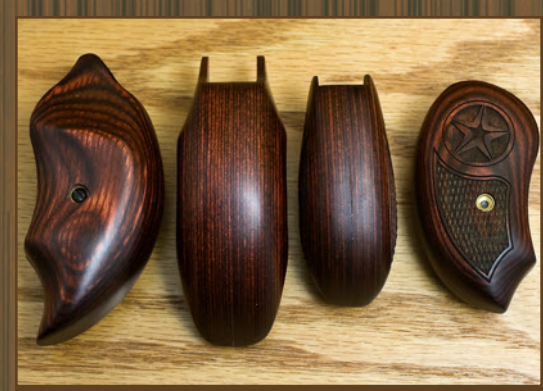
The new Jumbo grip (left) has a unique curved design. The rounded shape, along with increased panel thickness and an extended finger rest, acts to reduce felt recoil.