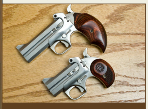
A whole different ball game with the turn of just two screws.

.327 Federal is a relatively new round with grand potential. Though other gun manufactures are still catching up, Bond has their .327 barrel ready to go. This round promises recoil similar to .38 Special while delivering performance similar to a .357 Magnum. In the Bond Arms pistol, the 85 grain Hydro Shock lived up to that promise, proving to be both accurate and comfortable to shoot. If you want to bring the recoil of